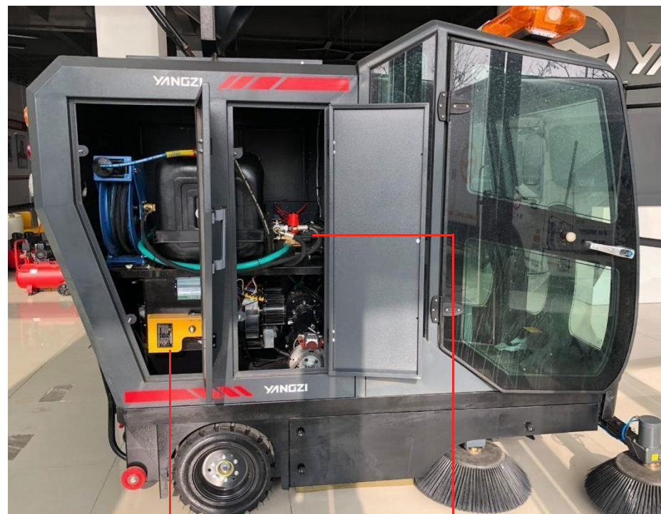
Control box of high pressure clean